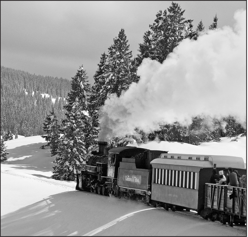
As a contrast to the current hot days of summer, the first run of the Cumbres and Toltec's 2008 season was on a decidedly wintery May 24, 2008, here westbound near Tanglefoot.