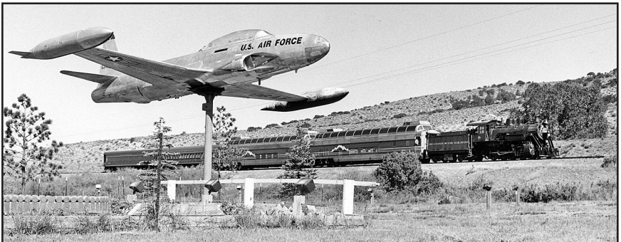
Eastbound Rio Grande Scenic Engine 18 passes Veteran's Memorial Park in Fort Garland, Colorado on August 21, 2007.