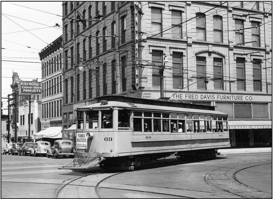
Turning from Larimer onto 15th Street, route 72 car 69 is heading for Denver General Hospital at West 6th Avenue and Cherokee Street.